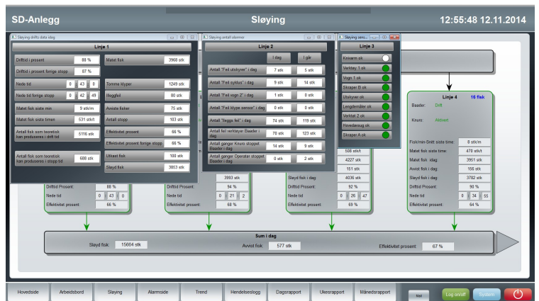
Shows a selection of expanded info. Here you can retrieve background data to gain more detailed information on the status for gutting lines.