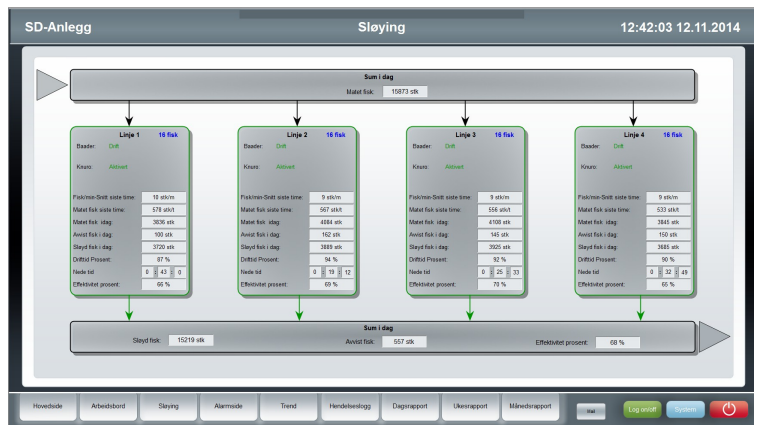
Status overview showing production data so far on that day (date shown top right corner).

The Boss generates and transmits automatic reports on current production to designated persons in the company.